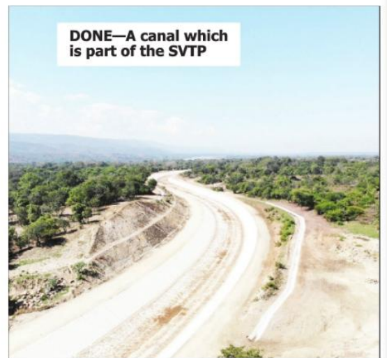
DONE— A canal which is part of the SVTP