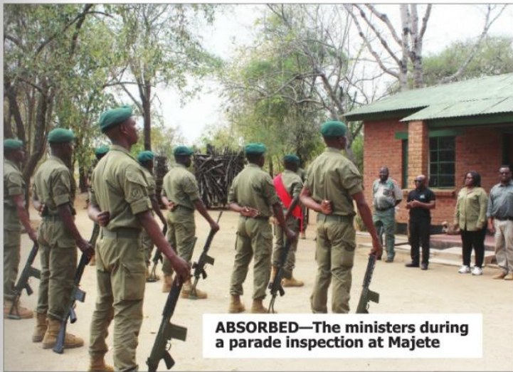
ABSORBED— The ministers during a parade inspection at Majete