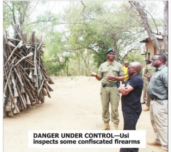
DANGER UNDER CONTROL— Usi inspects some confiscated firearms

SVTP is working with African Parks on conservation of natural resources in Majete Wildlife Reserve as one of the protected areas within the project catchment area. African Parks Majete works is implementing livelihood restoration and conservation programmes with communities surrounding the reserve with support from the project.