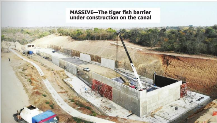
MASSIVE— The tiger fish barrier under construction on the canal