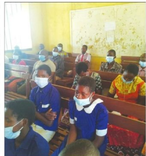
Some of the girls listen to a presentation