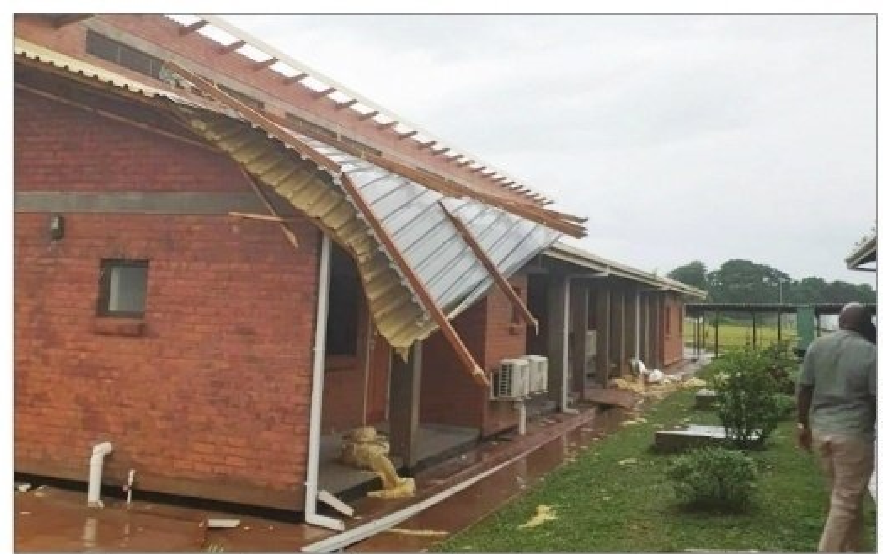
Part of the centre that was damaged by rains recently

Minister of Health Jappie Mhango says the Cancer Centre in Lilongwe will open as soon as the installation of bunkers at the newly-constructed facility is completed. The minister made the remarks Friday in Lilongwe during the commemoration of World Cancer Day, which also saw the country launch the National Cancer Strategic Plan.