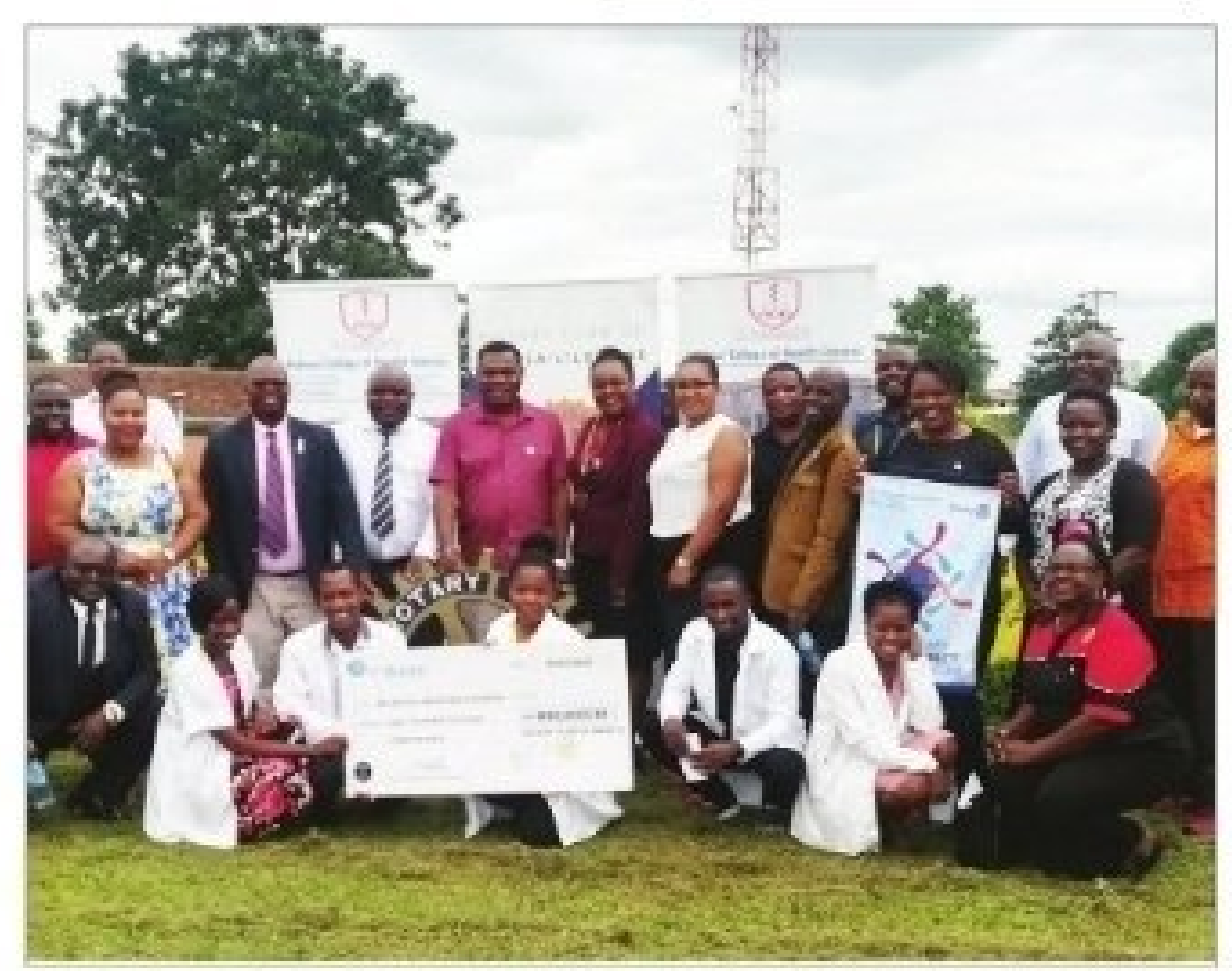
Members of the Rotary Club pose with beneficiary students