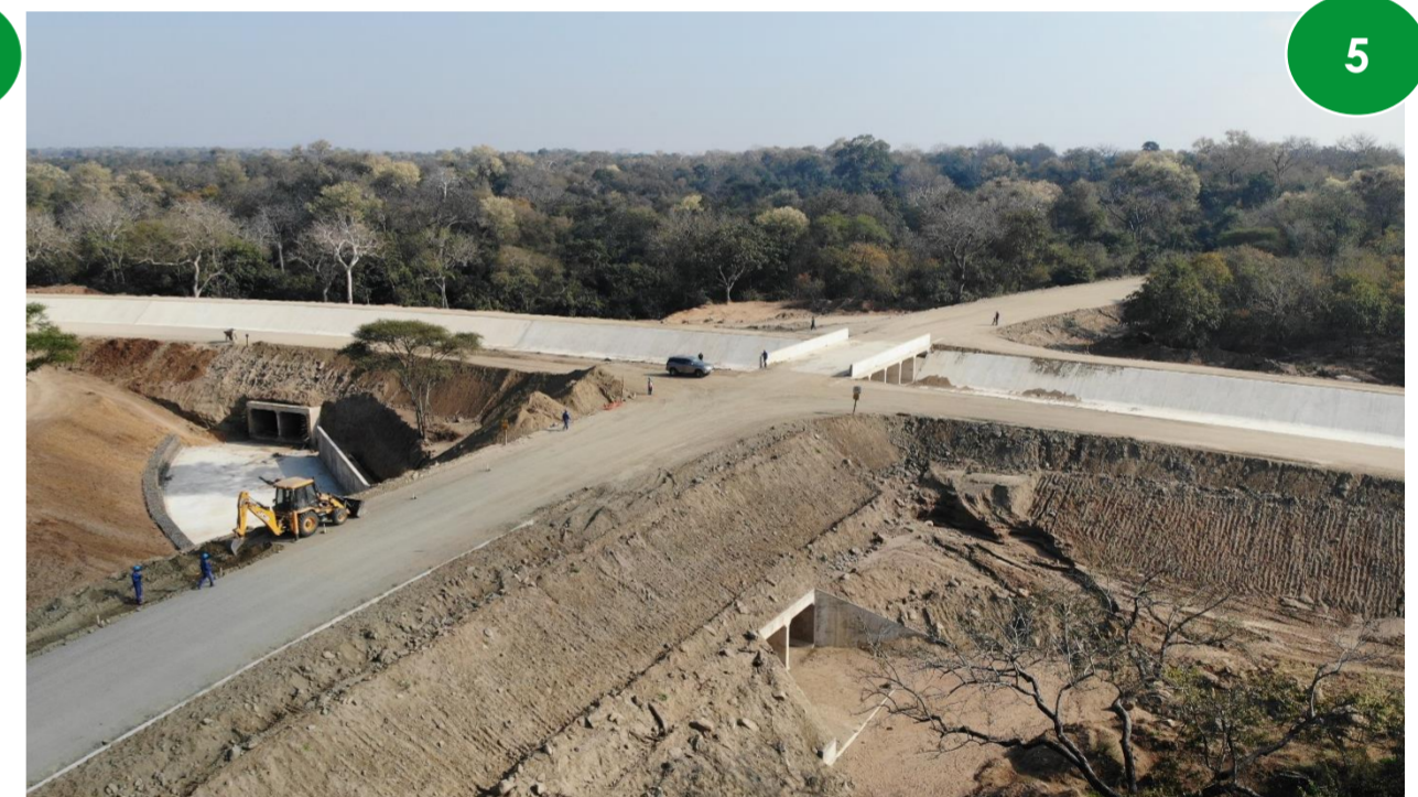
Pictures 1-6 provide some pictorial highlights on some major works taking place at the SVTP construction site in Chikwawa currently. Picture 1: Construction of 160 metre long Siphon 2 in progress, Picture 2: Part of the cleared canal route, Picture 3: Part of the 4.09kms concrete paved section of the canal, Picture 4: The 200 metre long tiger fish barrier structure under construction, Picture 5: One of the three completed bridges on the canal