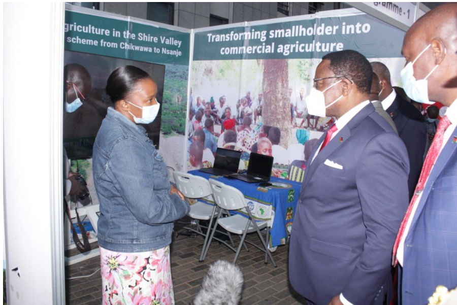
A presentation to the Head of State at the National Agriculture Commercialization Conference in Lilongwe

The President of the Republic of Malawi Dr Lazarus Chakwera has underscored the importance of the transition from smallholder to commercial farming for national development.