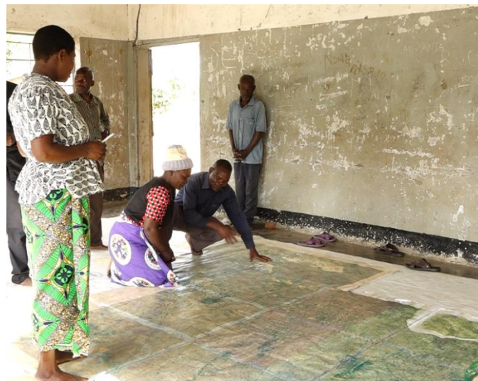
A map verification exercise in Chikwawa

The Ministry of Lands printed and displayed maps for 26 Group Village Heads (GVHs) and is preparing title plans and customary land certificates for the land parcels. The Ministry issued a new moratorium barring land sales and the issuing of new leases in the project area. The Ministry also provided clearance on land consolidation registration.