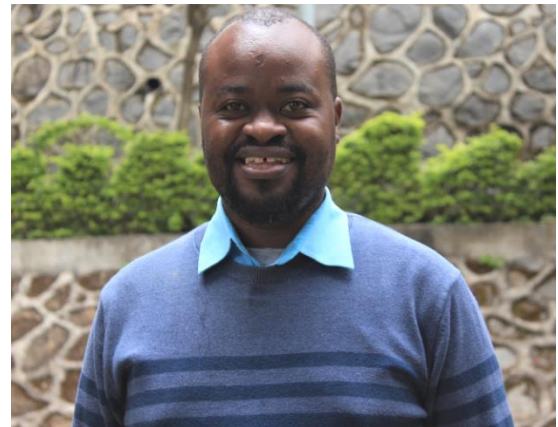
Chogawana: Knowing the status of species is important

“The Red List is a vital tool for species and ecosystem monitoring. It informs decision-makers on programs and projects to be formulated in biodiversity conservation, environmental impact assessments and land use planning. Since the Red List is a global inventory of conservation status of plant and animal species, knowing the status of species is important,” he said.