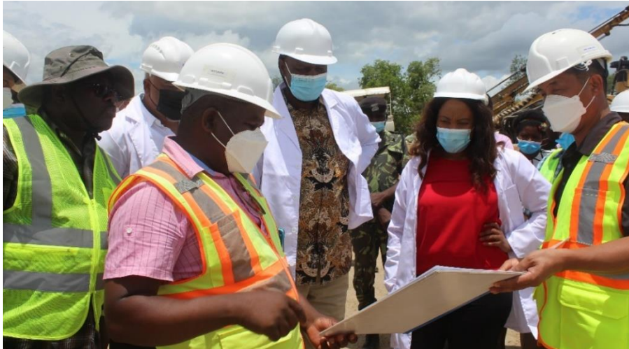
The Minister of Agriculture during the site visit

An Independent Panel of Experts comprising hydrologists, dam, geotechnical, environmental and social experts, was engaged to assess the damages. The consultant is redesigning the intake to suit current conditions following the impact of the Cyclone. In addition, the consultant is designing a cofferdam for the construction of the intake works, to protect the Kapichira Dam from further damage and to divert the water to the EGENCO intake for power generation. The Kapichira Dam is of paramount importance to the SVTP as it is the main source of water for the irrigation scheme.