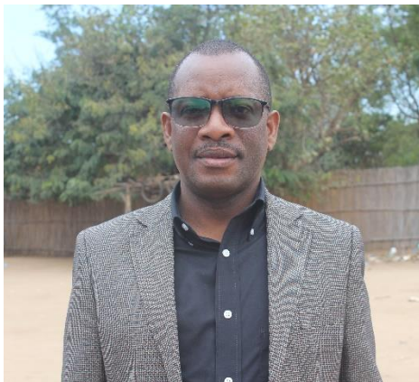
Msiyadungu: Report GBV

The SVTP GBV Service Provider, Catholic Commission for Justice and Peace (CCJP) conducted sensitization meetings with 168 construction workers in three construction sites belonging to Sinohydro, the company constructing the remainder of Main Canal 1 and part of Main Canal 2 in Chikwawa.