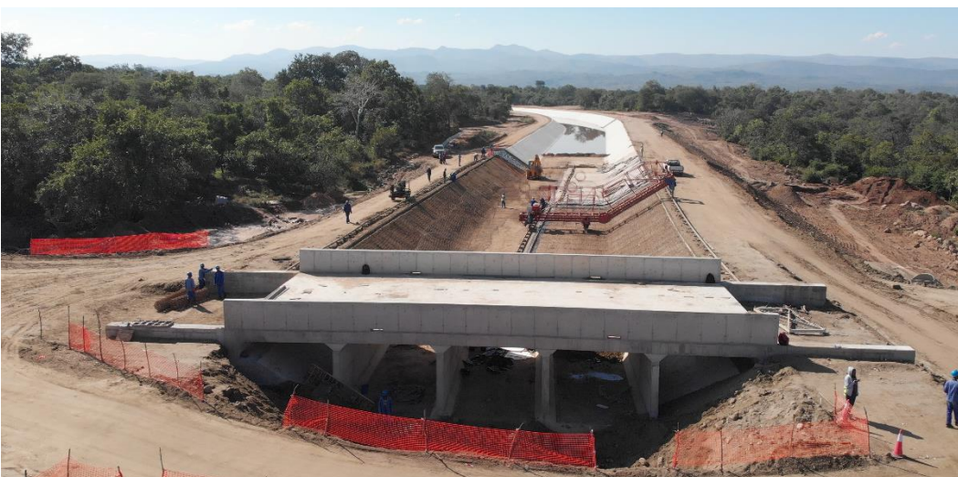
The fish barrier structure under construction (Top), the second siphon under construction (middle), bridge 3 during construction (bottom)