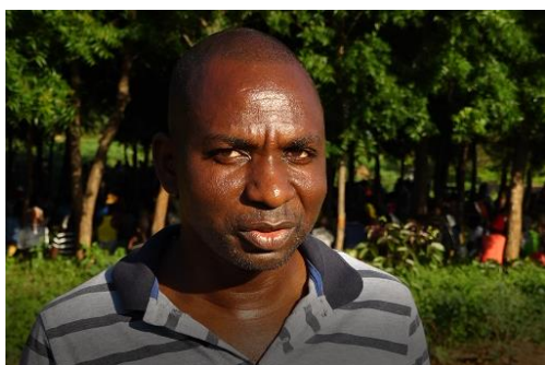
Chimpesa: We provide backstopping support

The cooperatives elected interim Board of Directors and six sub-committees for each of the five blocks. The Ministry of Trade and Industry trained 60 members from these five boards in bye-law formulation. 2,755 landowners in 27 established business centres under the five cooperatives (1929 women and 826 men) reviewed the formulated bye-laws. Business centres provide opportunities for villages under the cooperatives to discuss issues in detail before general assembly meetings. 2,720 landowners (1686 female, 1034 male) approved the bye-laws during five general assembly meetings before submission to the Registrar of Cooperative Societies for registration of the cooperatives. Officials from the Ministry of Trade and Industry provided backstopping support in the bye-law formulation process to ensure that the bye-laws are in line with the Law before submitting documentation for registration. Board of Directors and sub-committees have since been elected and trained for these cooperatives.