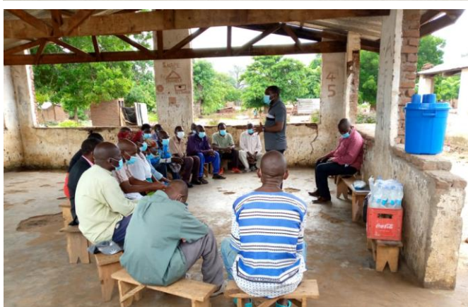
Top-Bottom: Engagement with chiefs