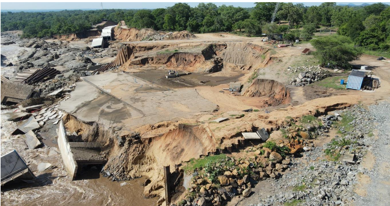
The SVTP intake foundation and coffer dam before Cyclone Ana (Top) and the intake foundation and part of the damaged cofferdam after Cyclone Ana (Bottom)