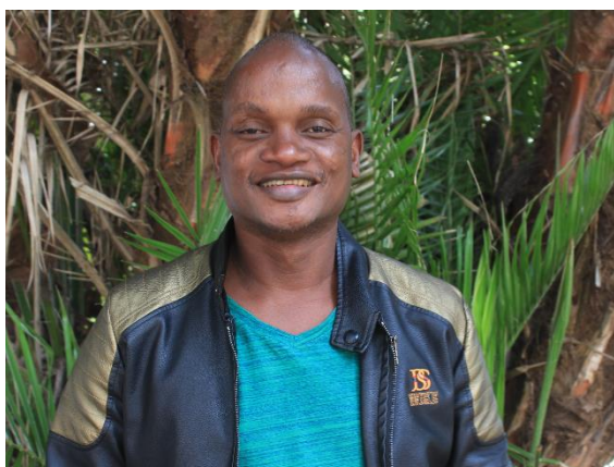
Mbano: Bills will bring sanity to land management

The project has been piloting some provisions of the bills through the Ministry of Lands since September 2020. Specifically, the project has been conducting a land adjudication and demarcation exercise in Chikwawa to secure land for project beneficiaries. The exercise is aimed at ascertaining land ownership and establishing boundaries for landowners. 45,833 land parcels covering 22,299 hectares have been adjudicated and demarcated for 48,175 landowners in Chikwawa district.