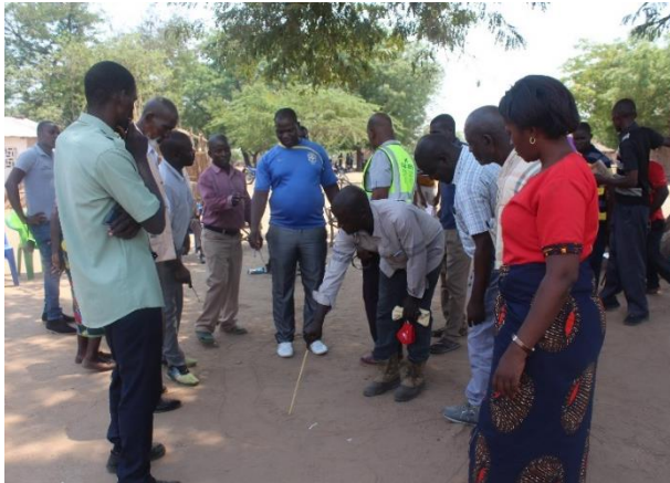
Community members developing a map

In the Mbenje area, community members in collaboration with the SVTP developed a community map showing all places proposed to be incorporated into the CCA including Gong’o wamkulu, Gong’o wamng’ono, Nyang’ona, Chiwonambwadza, Chisamba, Bulawayo, and Chimbvuli Beach. The map was vetoed by the whole community and other stakeholders and submitted to the Department of Lands for processing of the title deed for the CCA. So far communities under Mbenje CCA have contributed 2,164 hectares of land for conservation.