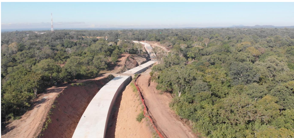
The completed rectangular canal/flume (Top), part of the excavation works for the Main Canals 1 and 2 (middle), progress on Siphon 1 (bottom)