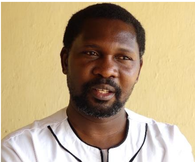
Chilonga: The Government is not taking away land

Land adjudication and demarcation involve ascertaining land ownership and determining boundaries as stipulated in the newly assented Customary Land Act (2022). The Act provides the citizenry with land ownership and ensures the security of tenure for future generations.