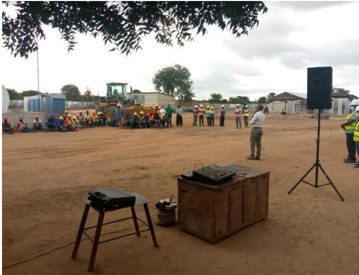
An engagement with construction workers at a Sinohydro Campsite