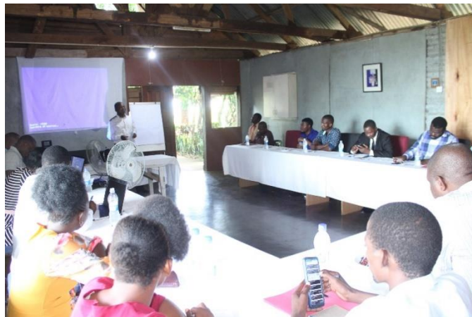
Clinician training in session