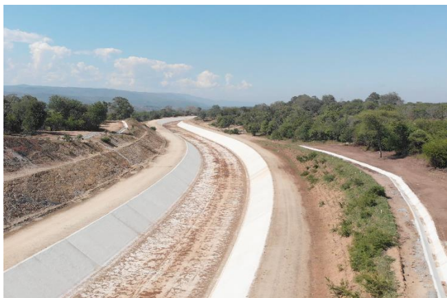
A section of the canal in Chikwawa

"We have managed to clear sites for the Main Canals 1 and 2 covering a stretch of 46kms from the 6km-point a little outside the Majete Wildlife Reserve. This section extends up to Lengwe National Park. We have also embarked on excavation works in this section. The contract for the construction of this section commenced in November 2021," said Engineer Chizalema.