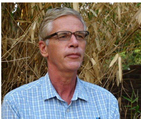
Stoutjesdijk: We will continue supporting the project

He further called for collaborative efforts from all stakeholders in watershed management in the Shire Valley as the area has been affected by bad farming practices and excessive tree cutting.