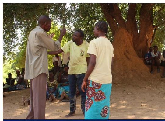
TFD Group during a performance at Mandilade Village