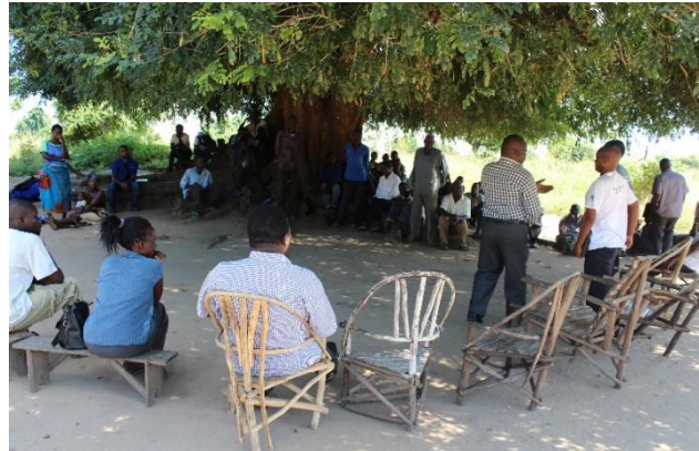
Members of a GRC being introduced to the community

The SVTP conducted five sensitization meetings in GVHs Mkanyoza (132 people), Mandilade (102 people), Mulangeni (74 people), Jailosi (88 people) and a joint meeting between GVH Rodrick and Senior Group Mangulenje which was attended by 58 people. The Meetings were aimed at sensitizing both Project Affect Persons (PAPs) and communities in general about the existence of Grievance Redress Committees (GRCs) in the impact areas as these structures are vital for addressing grievances arising from activities related to the construction of the Canal.