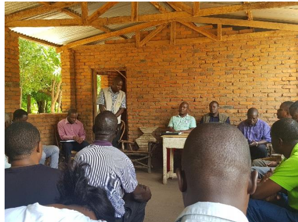
The DPD facilitating a grievance redress forum

Do you have questions or inquiries about the SVTP? Please contact us on: