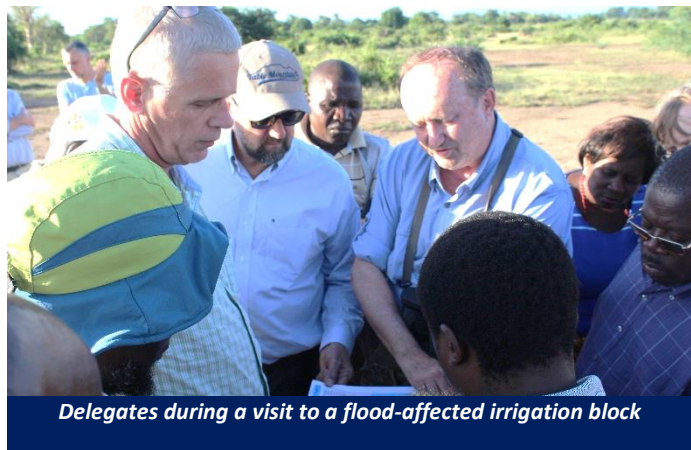
Delegates during a visit to a flood-affected irrigation block