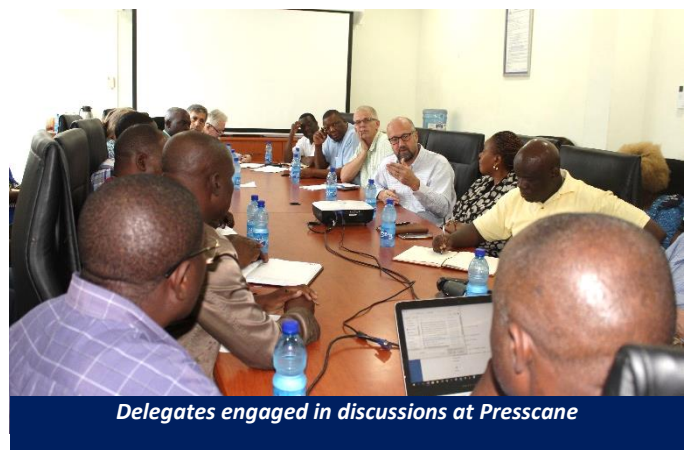
Delegates engaged in discussions at Presscane