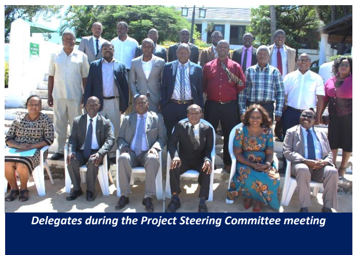
Delegates during the Project Steering Committee meeting