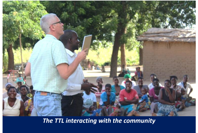
The TTL interacting with the community