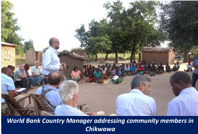
World Bank Country Manager addressing community members in Chikwawa

The SVTP continues to gain valuable input from its funders and implementing partners alike. Here are some pictorial highlights from some of the key activities undertaken by the Programme in the months of April and May, 2019: