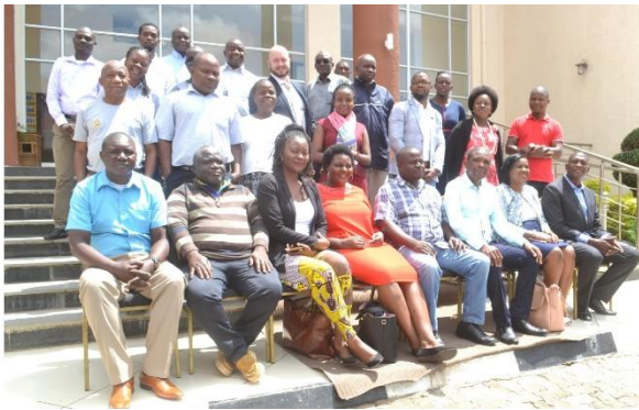
Participants during ABS Regulations Training Workshop

The Programme through the Natural Resources Management component being supported by the Global Environment Facility (GEF) held an orientation meeting to sensitize stakeholders on ABS regulation formulation process, explore synergies on permits issuances, modalities for competently analysing applications and issuance of permits and possibilities of establishing a Clear-House mechanism for ABS. The meeting was also aimed at formulating a National Task Team to formulate ABS Regulations. A nine-member Task Team has been formed. The Task Team will be responsible for formulating ABS Regulations.