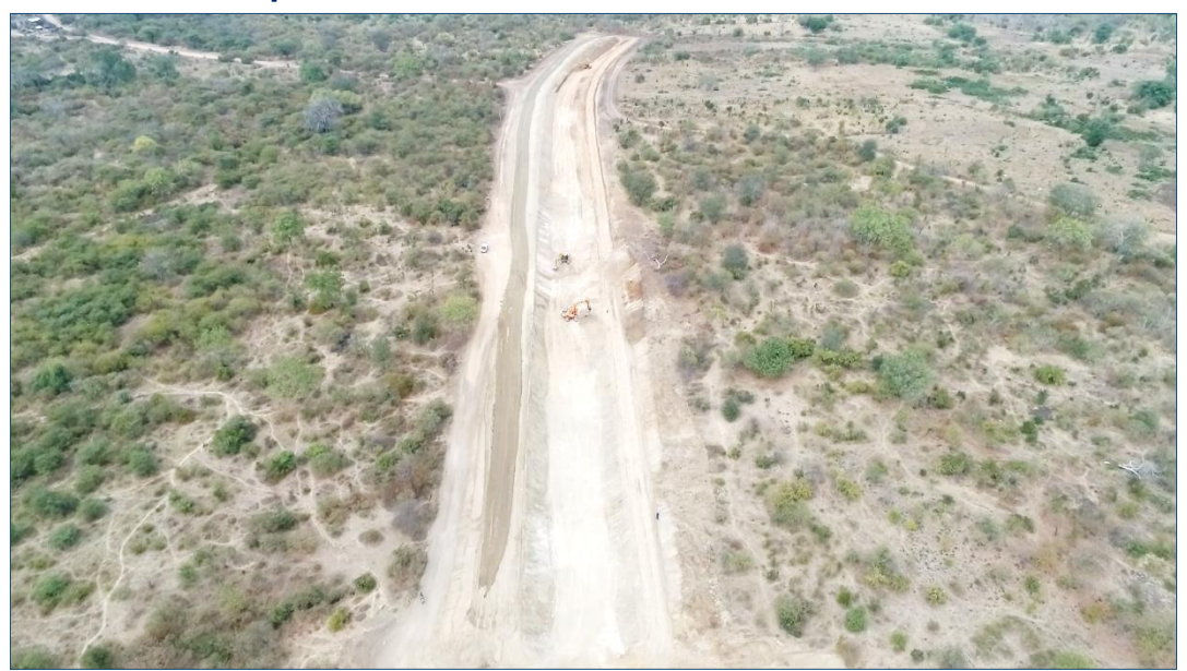
Some pictures on excavation of the canal route