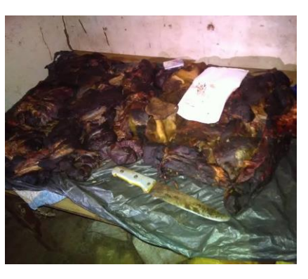
Left-centre: suspects at the police station. Far right: the buffalo meat

The suspects were taken to Thendo Police Unit and the incident was reported to Ngabu Police Station. After further investigation by the Police and African Parks, it was established that the buffalo was killed at Mwabvi Wildlife Reserve and the case was handed over to Mwabvi and Chiromo Police for prosecution on 21<sup>st</sup> June 2020. African Parks had been involved because at first the meat sellers had indicated that the buffalo was killed at Majete Wildlife Reserve but after further interrogation revealed that the animal came from Mwabvi Wildlife Reserve.