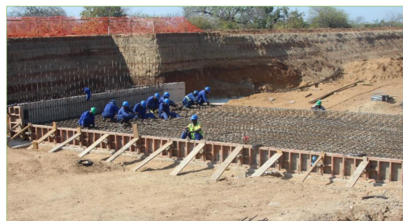
Construction of a bridge on the canal route