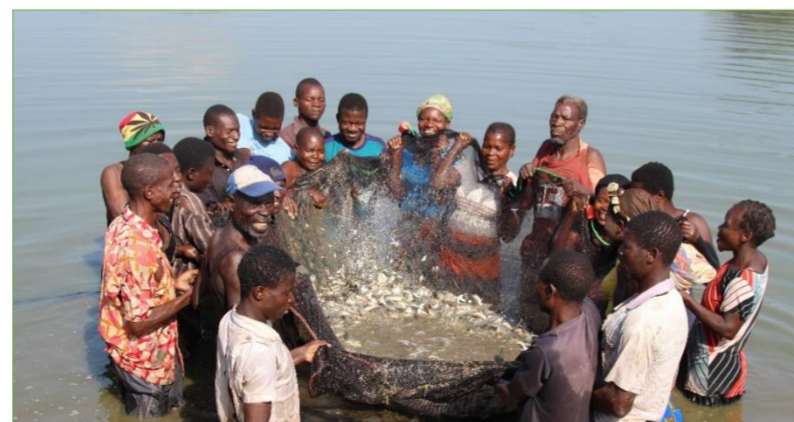
Fish harvesting at Nambozi Fish Club, T/A Maseya in Chikwawa