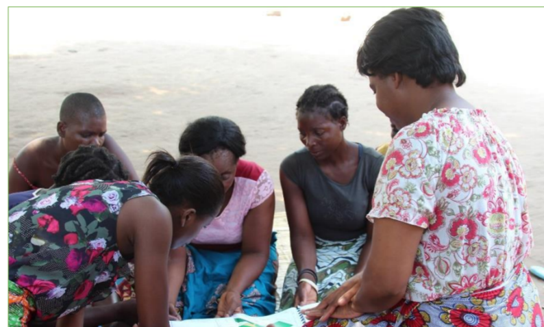
Verification of land use plans in progress