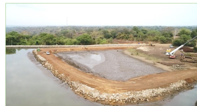
The drained cofferdam at the Intake Site at Kapichira Dam