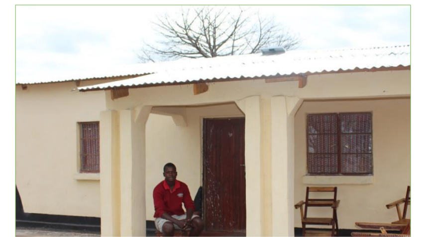
A project affected person sitting outside his new house