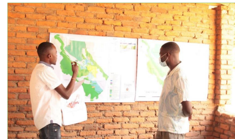
Chikwawa Physical Development Plan on display