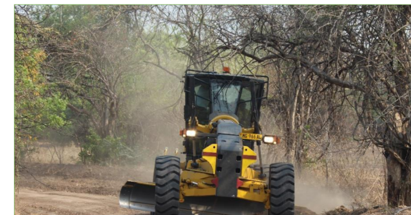
Road grading-connecting Old and New Lengwe National Parks