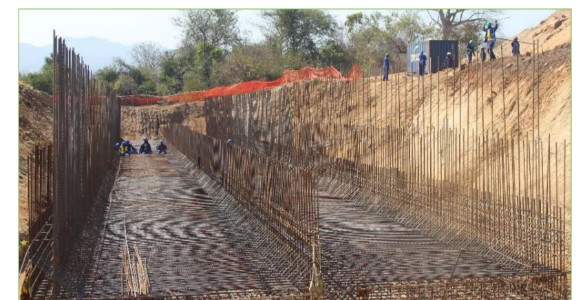
Drainage works on the canal route