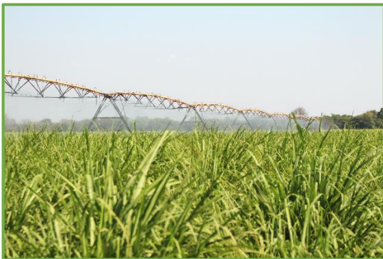
Irrigation farming using centre pivots at Illovo Sugar

Agricultural land is scarce in Malawi with 70% of small scale farmers farming less than one hectare of land. Over the years, rains in Malawi have become erratic and less predictable leading to low productivity. This, in addition to adverse effects of climate change including drought, floods, and declining soil fertility all of which have negatively affected the agriculture sector in Malawi.