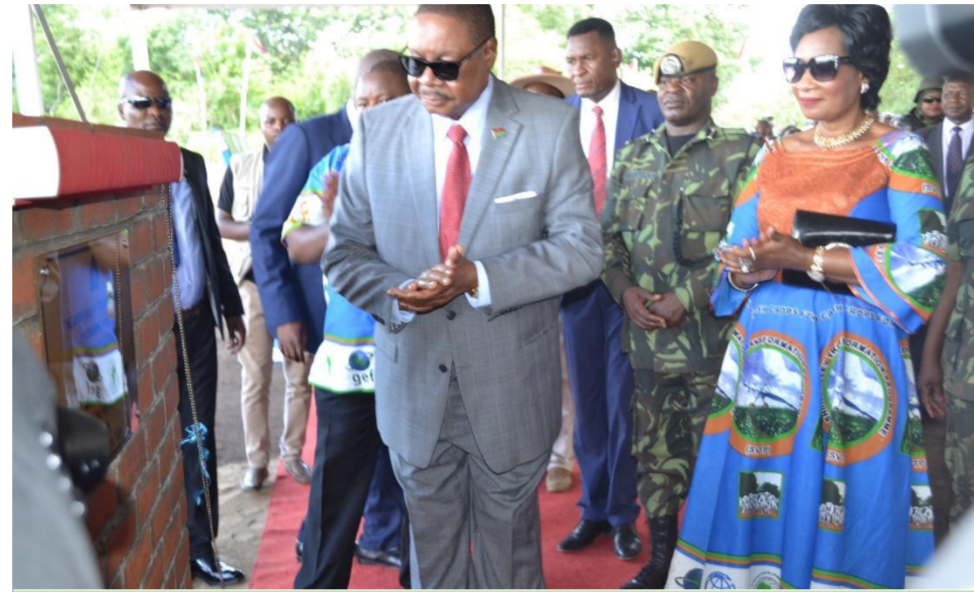
The State President, His Excellency Professor Arthur Peter Mutharika unveiling the plaque at the Intake Site at Kapichira Dam