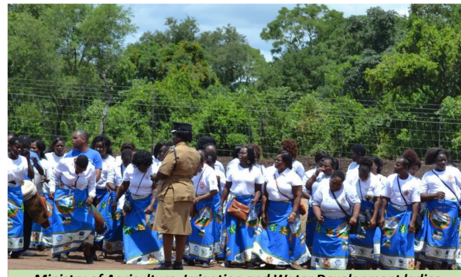
Ministry of Agriculture, Irrigation and Water Development ladies celebrating the launch of the SVTP-1