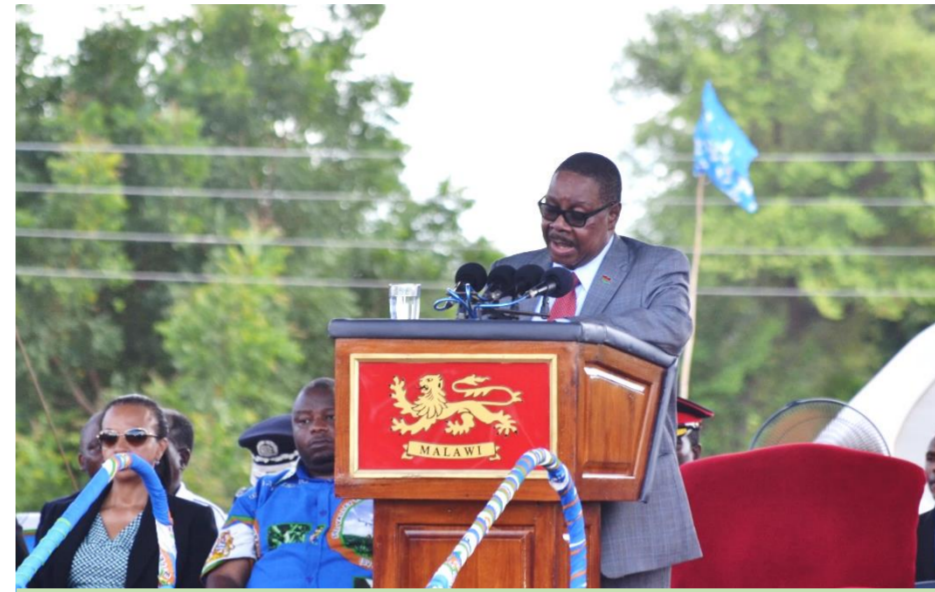
The State President, His Excellency Professor Arthur Peter Mutharika officially launching the SVTP-1 at Chikwawa Community Centre Ground