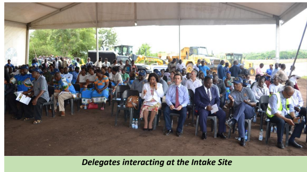
Delegates interacting at the Intake Site